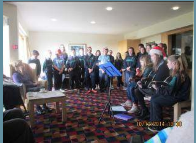
Carols & Jokes by the Strandhill Brownies